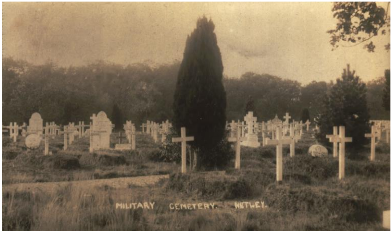
Original Cross markers – Netley Military Cemetery