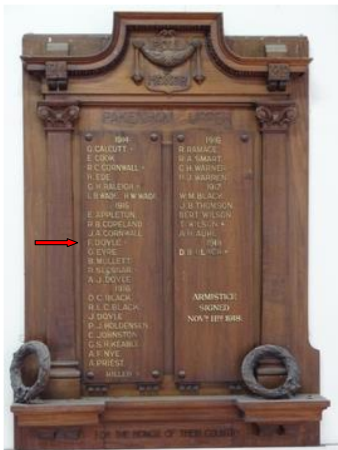
Pakenham Upper Honour Board

F. Doyle is remembered on the Pakenham Upper Honour Board, located in Pakenham Upper Hall, corner Bourke's Creek Road & Old Gembrook Road, Pakenham Upper, Victoria.